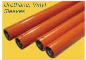
Urethane, Vinyl Sleeves

We specialize in sleeve coverings for motorized rollers.