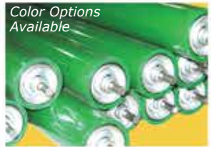
Color Options Available